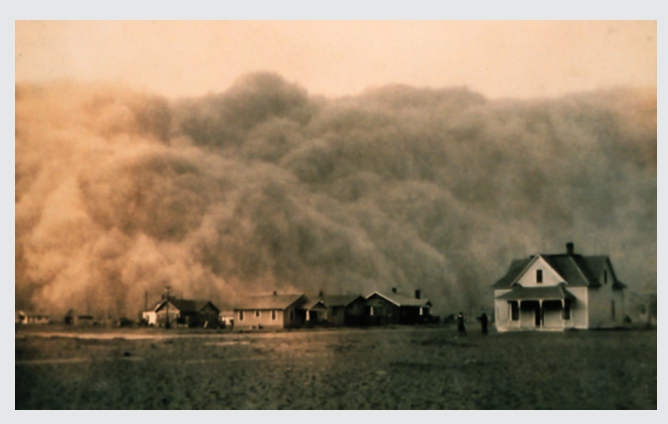
Figure 1. Dust storm approaching Stratford, Texas; Dust Bowl surveying in Texas. April 18, 1935