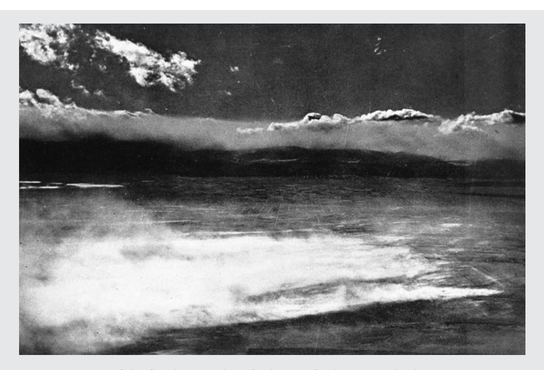
Figure 2. One of the first known aircraft photos of a dust storm in the USA, eastern Colorado during the Dust Bowl, 1936. Note the emission of dust in linear plumes (from north to south: right to left on the picture) from a limited sector of the landscape, while surrounding areas are not blowing.

Compared to the 1930s Dust Bowl days, we now have a much greater scientific understanding of airborne dust, its causes, characteristics, controls, and effects, but many challenges remain. Even under ideal conditions, dust can be raised profusely from one localized part of the landscape while an equivalent adjacent area remains dust-free; one agricultural field will blow a brownout, while the adjacent field will remain stable (Figure 2). Chaos-scale fluctuations of wind and soil probably have a role in this variability.