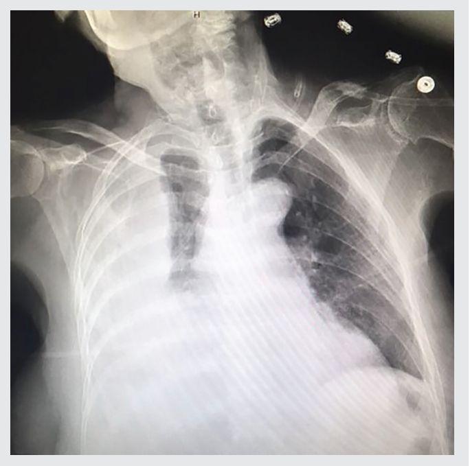
Figure 1. Portable semi-upright chest x-ray showing a large right-sided, loculated pleural effusion with compressive atelectasis of the right lung.

with 73% neutrophils. Urinalysis was consistent with a urinary tract infection. Computed tomography of the abdomen and pelvis revealed bibasilar atelectasis, a right lower lobe infiltrate and a right-sided pleural effusion, but no evidence of pyelonephritis. Upon further questioning, the patient had had a non-productive cough for about one week prior to presentation. She was admitted to the hospital and started on empiric IV antibiotics to cover a urinary tract infection and suspected aspiration pneumonia. Her chest x-ray progressively worsened over the next three days as she developed a large, right-sided loculated pleural effusion with compressive atelectasis (Figure 1). Therapeutic thoracentesis was then attempted but yielded only 100cc of cloudy, yellow fluid, due to increased viscosity preventing adequate flow. The pleural fluid analysis was compatible with an empyema (Table).