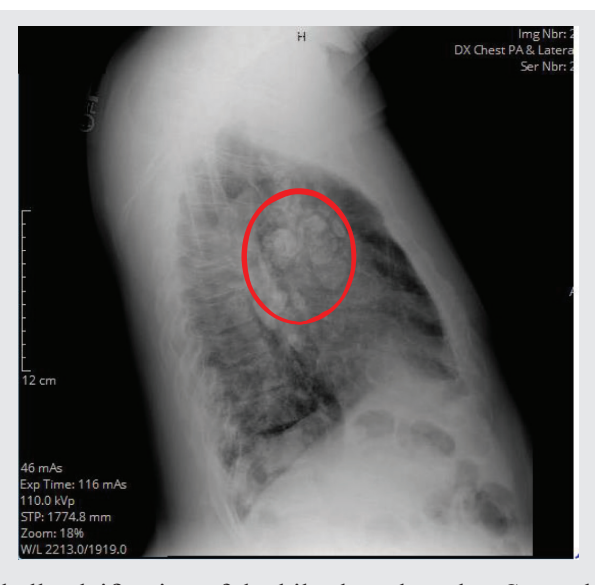
Figure. PA and lateral chest x-rays demonstrate bilateral egg shell calcification of the hilar lymph nodes. See red circles.

Corresponding author: Gilbert Berdine Contact Information: Gilbert.berdine@ttuhsc.edu