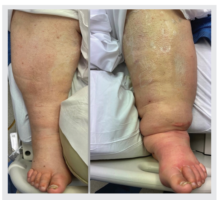
Figure 1. Bilateral non-pitting edema extending from the leg to upper thigh, more prominent on the left side.

Corresponding author: Mahmoud Abdelnabi Contact Information: Mahmoud.Abdelnabi@ttuhsc.edu DOI: 10.12746/swrccc.v10i43.1029