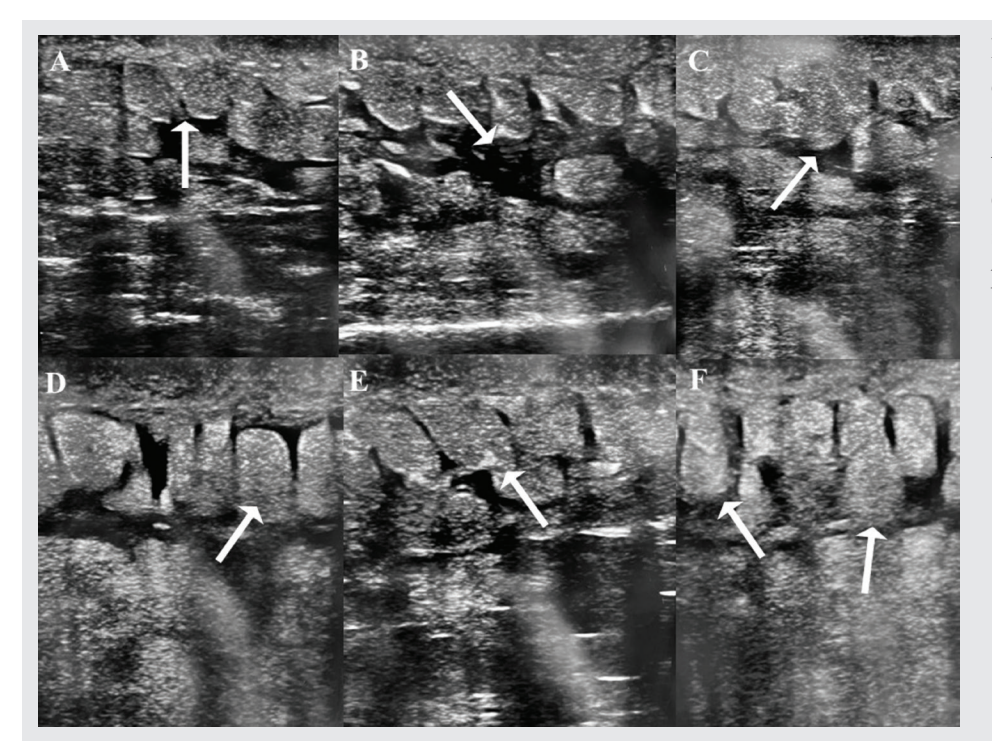
Figure 2 (Panels A–F). Ultrasonography of the lower limb showing increased skin and subcutaneous tissue thickness and increased subcutaneous echogenicity representing increased subcutaneous fluid in a cobblestone paved appearance (Arrows).