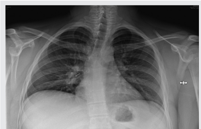
Figure 1. Chest x-ray of the patient demonstrating radiopaque FB in the right lower lobe bronchus.

remove the FB along with the ET tube after securing the sharp end inside the ET tube. Likewise, the simulation demonstrated that forceps would be sufficient to grasp the FB, but additional FB retrieval tools were available if necessary.