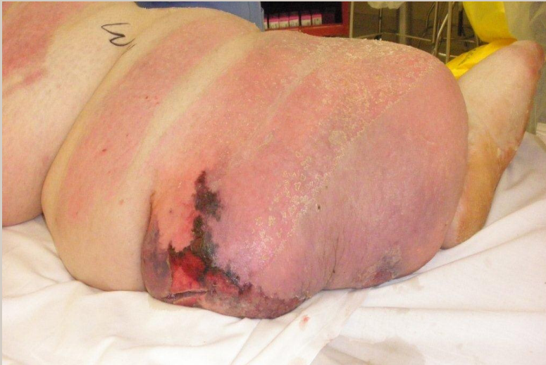
Figure 1 Left leg with necrotizing soft tissue infections.