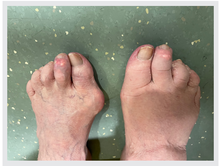
Figure 3. Tophi at both proximal interphalangeal joints of the second toes and tophi and a 4 \text{ cm} \times 3 \text{ cm} tophus at the first left metatarsophalangeal joint.

How should this patient with uncontrolled chronic tophaceous gout and an allergic history to allopurinol be treated? A study by Fam demonstrated that slow desensitization with oral allopurinol resulted in a 78% success rate; the maintenance dosage of allopurinol