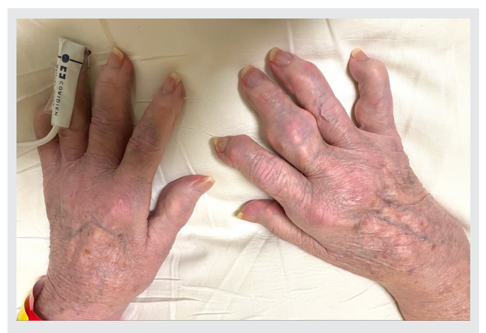
Figure 2. Tophi in both hands-prominent at the right middle proximal interphalangeal joint.