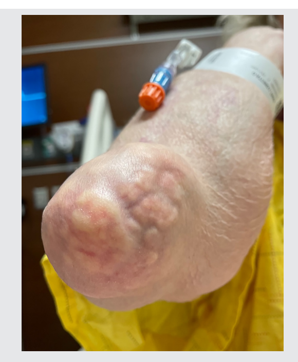
Figure 1. A tophus measures 10 \text{ cm} \times 5 \text{ cm} in the right elbow.

Corresponding author: Busara Songtanin Contact Information: Busara.Songtanin@ttuhsc.edu DOI: 10.12746/swrccc.v12i50.1279