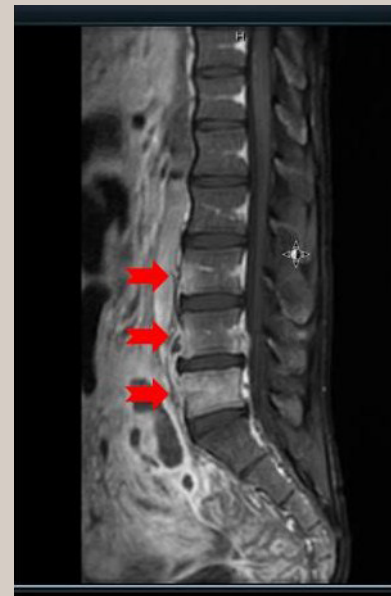
Figure 2. Abnormal enhancement at anterior aspect of L3 and L4 vertebral bodies and abnormal enhancement in the left half of the L5 vertebral body extending to the pedicle, transverse, and articular processes of L3-L5

Corresponding author: Saranapoom Klomjit MD Contact Information: saranapoom.klomjit@ttuhsc.edu DOI: 10.12746/swrccc2014.0206.073