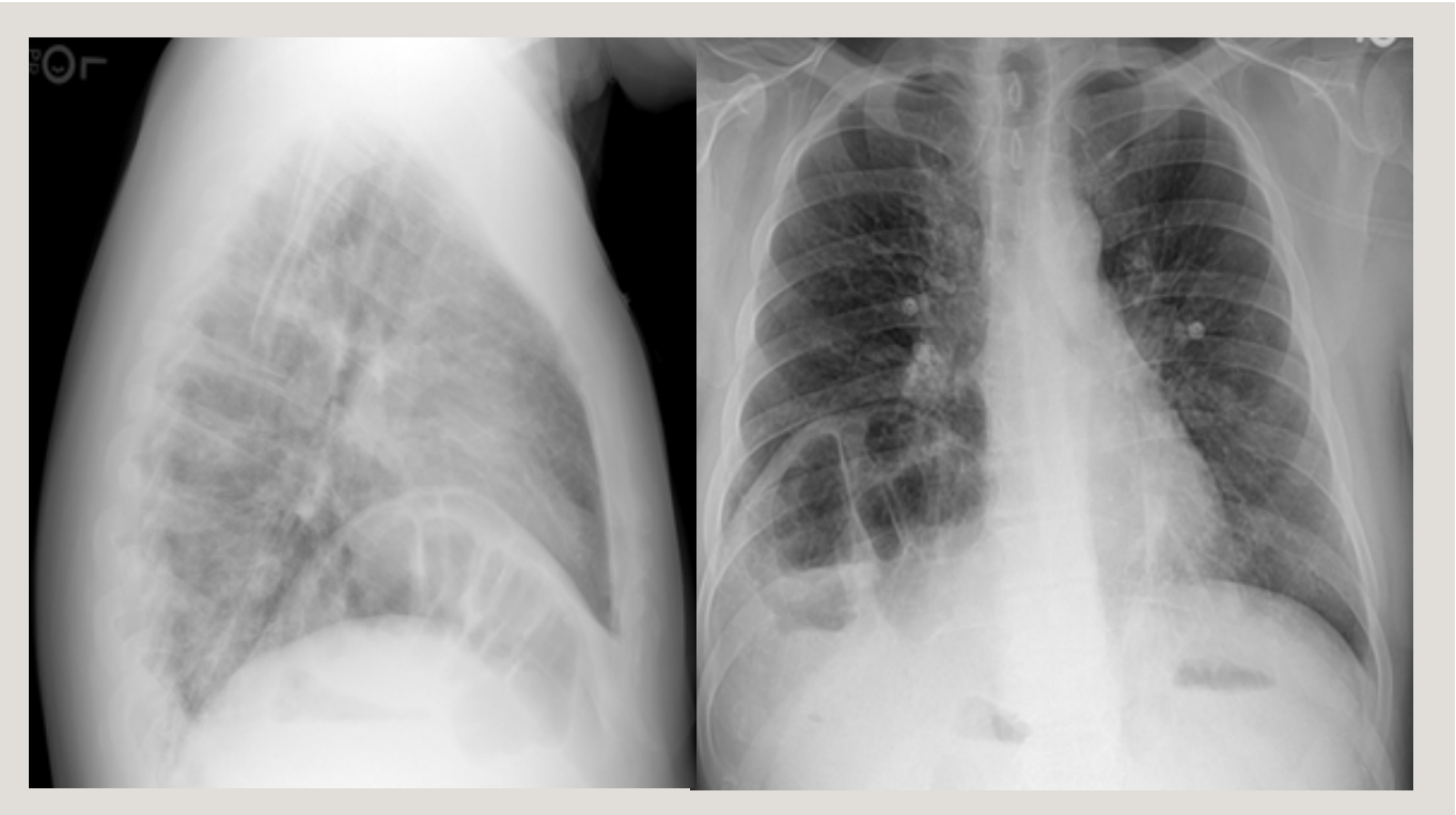
Figure 1. Chest x-ray posteroanterior and lateral showing anterior location of loops of bowel.

Hepatodiaphragmatic interposition of the intestine is known as Chilaiditi sign/syndrome and was described by Demetrius Chilaiditi in 1910. The term "Chilaiditi sign" is used in an asymptomatic person and the term "Chilaiditi syndrome" in symptomatic patients <sup>1</sup>. It is a rare and often asymptomatic anomaly, typically diagnosed as an incidental radiographic finding. However, these patients can have intermittent abdominal pain, distention, vomiting, anorexia, and constipation that on rare occasions require surgical