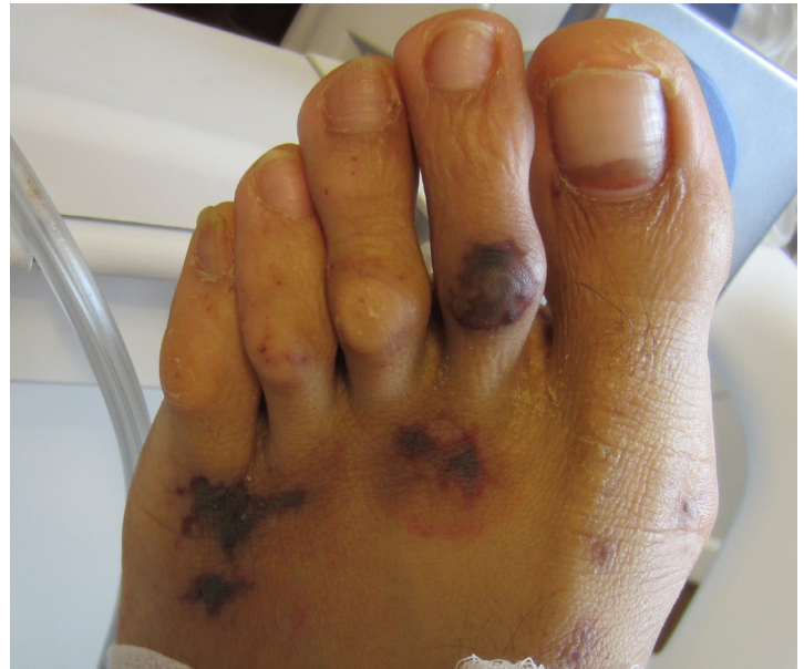
Figure 1 is a photograph of the macular purpuric rash on the left foot.

LCV, also known as hypersensitivity vasculitis, is a relatively common condition. It can occur as a primary disorder or in association with drugs, infections, collagen-vascular diseases, hematologic disorders, and malignancy. 2 The American College of Rheumatology proposed criteria to define leukocytoclastic vasculitis which include: patient age greater than 16, use of a possible drug in temporal relation to symptoms, palpable purpura, maculopapular skin lesions, biopsy of a skin lesion showing neutrophils