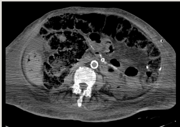
Figure 3. CT abdomen showing extensive vessel calcification, bowel dilatation, wall edema, and pneumatosis intestinalis