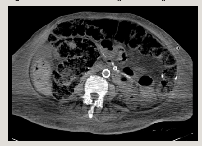
Figure 3. CT abdomen showing extensive vessel calcification, bowel dilatation, wall edema, and pneumatosis intestinalis