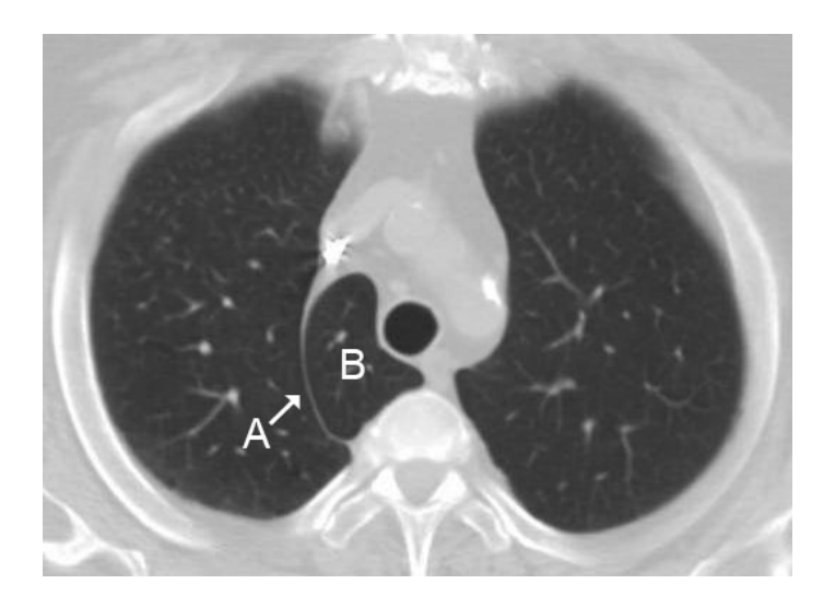
Figure2: CT scan of the chest depicts the fissure (A) as a curved/C-shaped line. It originates at the area of right brachiocephalic vein and SVC and ends at the lateral side of the vertebral bodies and the azygos lobe (B).

physical examination showed no abnormal findings. Computed tomography of the chest revealed an azygos lobe in the right lung that was smooth and regular in shape; no other pathological changes were found (Figure 2). Fiberoptic bronchoscopy showed a blood clot in the apical segment of the right upper lobe. Hemostasis with the local administration of thrombin and endobronchial sealing was attempted but unsuccessful. A thoracic angiogram showed no dilated bronchial arteries. Bronchial artery embolization was attempted but was not successful. A surgical intervention was pursued. It was found that the posterior segment of the right upper lobe was tucked behind and compressed by the azygos lobe and was grossly hemorrhagic. Segmentectomy was performed. Histopathology showed a large number of macrophages with hemosiderin pigment and fresh hemorrhage in the alveoli. No tumor, infection, or vascular malformations were found. The alveolar basement membrane was negative for IgA, IgG, IgM, and C3. The patient had no postoperative complications, and his symptoms resolved.