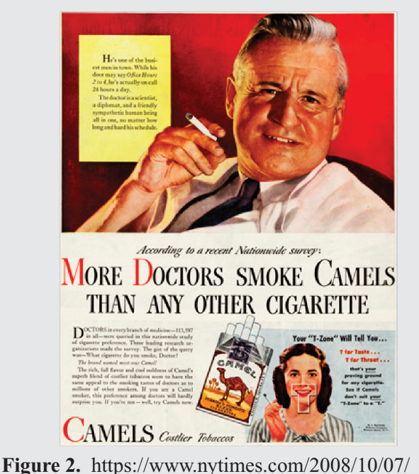
Figure 2. https://www.nytimes.com/2008/10/07/ business/media/07adco.html

head tilted back as an equally fashionably dressed man behind her leans forward. Each smokes a cigarette; the tips of their cigarettes touch, releasing small clouds of smoke that drift upward. The emotional impact is obvious; smoking is alluring. Deconstructing this image requires critical thinking skills, exactly the opposite of the image's goal.