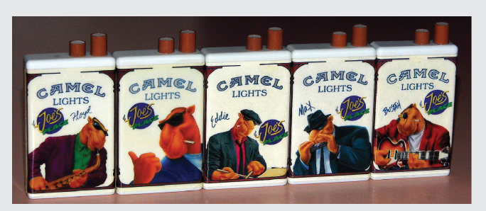
Figure 5. Set of 5 Joe Camel Promotional Cigarette Lighters, Camel Lights Cigarettes.

Joe Camel (officially Old Joe) was the advertising mascot for Camel cigarettes from late 1987 to July 12, 1997. The R. J. Reynolds Tobacco Company, the maker of Camel cigarettes, was alleged to have targeted children with their Joe Camel advertising. 2 August 2014 By Joe Haupt from USA [CC BY 2.0 (https://creativecommons.org/licenses/by/2.0)], via Wikimedia Commons