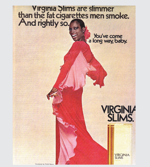
Figure 4. Virginia Slims ad. http://moazedi.blogspot.com/2014/04/youve-comelong-way-baby.html

But why should men have all the fun? In 1968 Philip Morris began an advertising campaign specifically targeting girls and women. Couched in language and images that encourage liberation and independence, the "You've come a long way, baby" ads for Virginia Slims cigarettes resulted in a 110% increase of initiation of smoking by twelve-year-old girls within six years.<sup>5</sup> Taking advantage of the burgeoning Women's Liberation Movement and society's obsession with thinness, the ads touted Virginia Slims as empowering women, even ironically to sponsoring a tennis tournament. Surely smoking couldn't hurt an athlete! While the Marlboro Men ads portrayed men