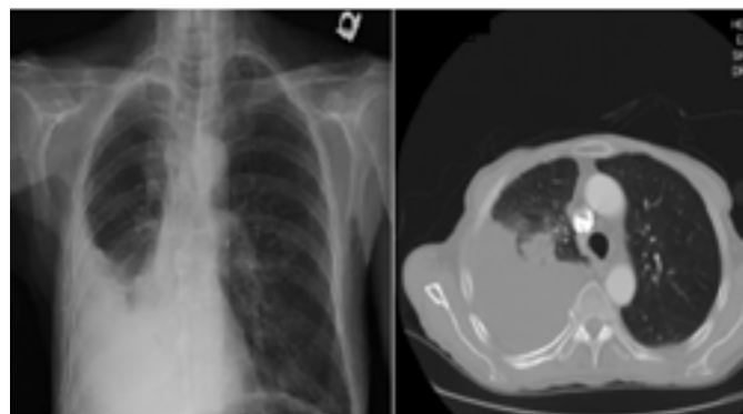
Figure 4. Plain chest X-ray showing a large right pleural effusion. The CT scan reveals a right pleural effusion and a tissue density above the effusion.

and decreased tactile fremitus on the right side. This additional history and physical examination information led to imaging studies of the chest. A chest X-ray