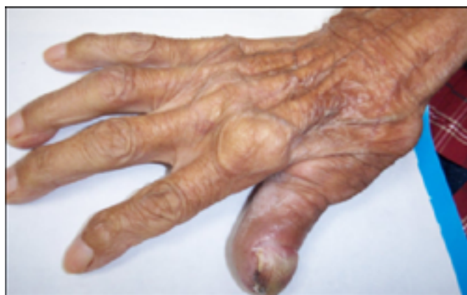
Figure 1. Photograph of right thumb with a swollen raised nail.

An 85-year-old Hispanic man presented with a swollen and small “sore-like” area on his right thumb which had been present for approximately four months. When this began to enlarge, he sought care from his physician and was treated multiple times for soft tissue infection. The antibiotic therapy did not improve the patient’s symptoms, and he continued to have increased swelling, erythema, tenderness, and