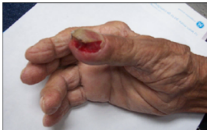
Figure 2. Photograph of right thumb showing ulceration below the nail.

Corresponding author: Kamonpun Ussavarungsi Contact Information: Ussavarungsi.Kamonpun@mayo.edu DOI: 10.12746/swrccc2013.0101.010