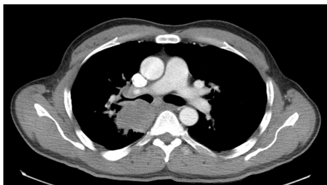
Figure 2. CT scan showing a right mass extending from right perihilar region.

showed an immunophenotype positive for cytokeratin (AE/AE3) and placental alkaline phosphatase and negative for CK6, CK20, TTF1, p63, and CD30. This pattern was consistent with the pathological diagnosis of seminoma. Scrotal ultrasound did not demonstrate any mass present. The tumor markers beta human chorionic gonadotropin (beta-HCG), lactate dehydrogenase, and alpha fetoprotein (AFP) were negative. Physical exam and CT scans of the head, abdomen, and pelvis did not reveal other foci of metastasis. He was diagnosed with primary mediastinal seminoma and was started on bleomycin, etoposide, and cisplatin. His symptoms improved significantly after his first cycle of chemotherapy, and he remains on treatment.