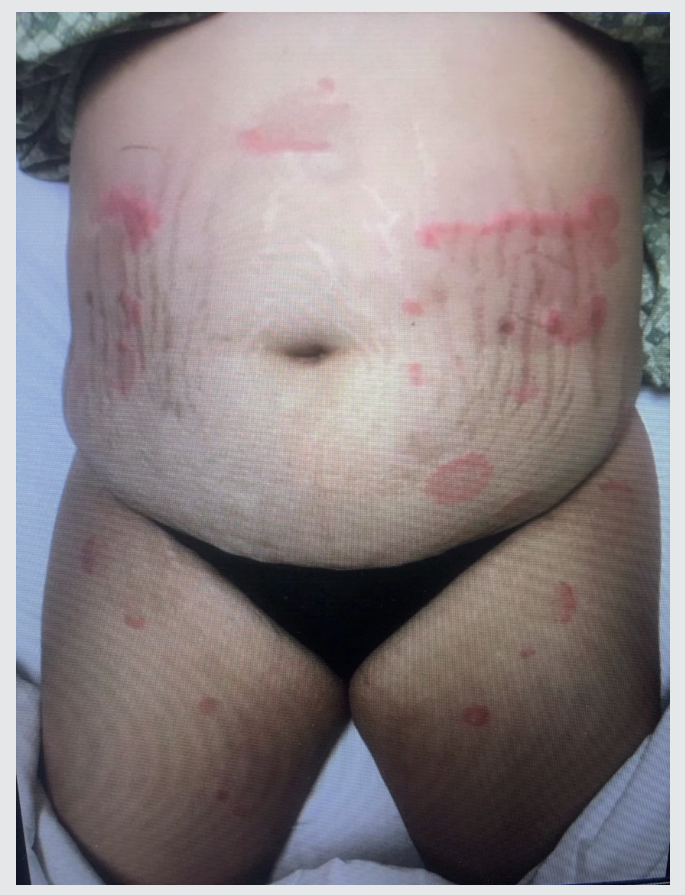
Figure 1. Annular erythematous plaques on the abdomen and thighs.

fluid with 3200 red cells/mm<sup>3</sup> and 2558 leukocytes/mm<sup>3</sup> (84% eosinophils, 9% lymphocytes, 7% monocytes). Pleural fluid LDH was 663 IU/L (corresponding serum value: 245 IU/L), and pleural fluid protein was 4.9 g/dL. Gram stain was negative, and cultures for bacterial and fungi had no growth. Investigations conducted over the subsequent week for infectious, autoimmune, and neoplastic conditions are summarized in Table 1. The skin lesions lasted a few days, and then similar lesions appeared at various other sites over the next week.