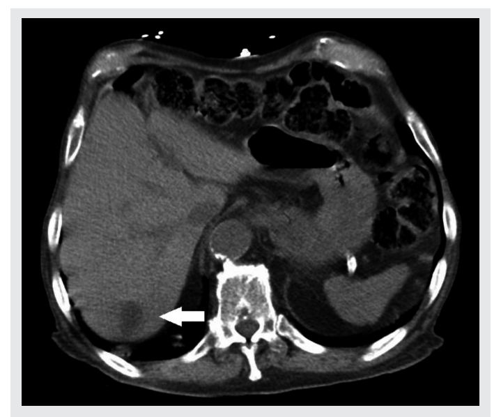
Figure 2. CT demonstrating cyst in right lobe of liver.

this admission, endocrinology service was consulted, and a diagnostic 72-hour fast was initiated to determine the etiology of hypoglycemia. Blood glucose was monitored every hour until it fell below 55 mg/dL. Symptomatic hypoglycemia occurred after four hours of fasting and the following blood tests were drawn: plasma glucose 43 mg/dL insulin 15.4 U/mL (2.6-24.9 U/ mL), C-peptide 21 ng/mL (1.1–4.4 ng/mL), proinsulin