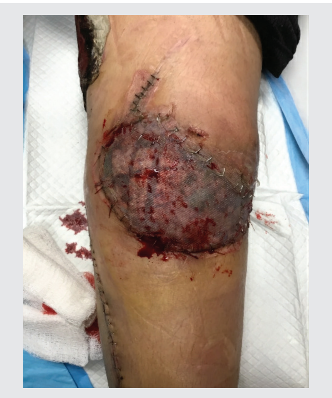
Figure 1. Split thickness graft to left knee with donor site to medial thigh at left lateral extremity 04/10/20.

tendon laceration. She underwent incision and debridement (I&D) followed by a rotational flap closure of the open wound. Following initial discharge on December 20, 2019, the patient returned to the Emergency Department (ED) on January 9, 2020, and was admitted for overnight observation due to suspected cellulitis vs. deep tissue infection. Vancomycin and piperacillin-tazobactam were started for empiric coverage and were later changed to trimethoprim-sulfamethoxazole (TMP-SMX). The patient returned to the ED and ultimately underwent another round of I&D on February 10. She was again discharged with TMP-SMX and instructed to return to clinic in two weeks for wound inspection. On her return to the clinic, wound dehiscence was appreciated, and the patient underwent another round of I&D on March 12 and was admitted for IV antibiotics. Cultures were positive for S. aureus sensitive to TMP-SMX, which the patient once again received after discharge.