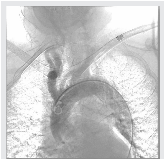
Figure 3. Type III Aortic Arch. Angiogram shows that the patient has Type III aortic arch \geq 2 diameter of common carotid artery.