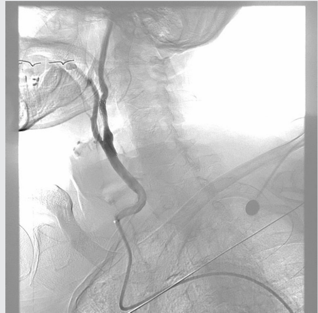
Figure 4. Carotid Artery Angiogram after Stenting. Stent placement increased blood flow slightly and significantly decreased the risk of emboli.

a day. Reflexive bradycardia is a well described post-procedural phenomenon following internal carotid artery stenting.