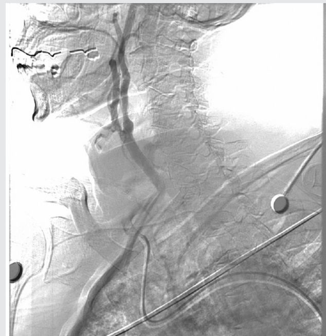
Figure 2. Carotid Artery Angiogram before Stenting. Right internal carotid artery stenosis reduces blood flow, which increases the risk of emboli.

The team proceeded with ultrasound-guided right common femoral artery access. The patient had a Type 3 aortic arch, which made advancement of the catheter difficult due to a sharp angle (Figure 3). Therefore, a curved sheath technique was used with 6-Fr vascular sheath. The Cook 90 cm Shuttle Sheath was manually curved by the operator and then positioned in the right common carotid artery. This was followed by crossing the stenosis using a 0.014 Whisper wire. Eventually, a Medtronic Protege 8–6 × 40 mm carotid self-expanding stent was placed at the site of the lesion in the internal carotid artery after placing the SpiderFX embolic protection device, since other filters were unpassable, which significantly reduced the risk of emboli (Figure 4). After the procedure, the patient was transferred to the CICU in stable hemodynamic condition. Post-operatively, he developed bradycardia without hypotension transiently