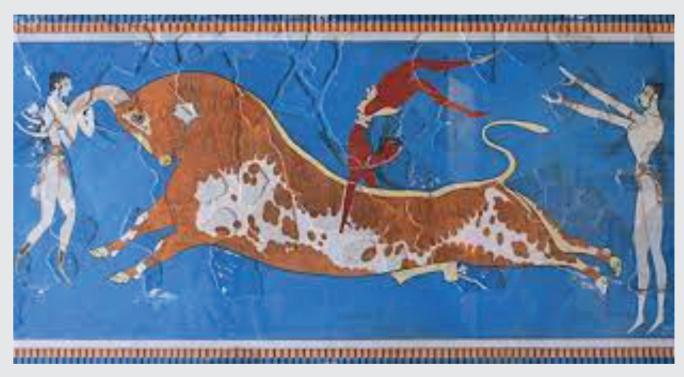
Bull-leaping . Stucco fresco. 1450 BCE. Palace of Knossos. Crete.

Consider the fresco found in the ruins of the Knossos Palace on Crete. It depicts bull-leaping, an activity apparently common in the Bronze age Minoan culture that flourished in Crete and the Aegean Islands. The bull is dangerous, as are the Covid variants. The leaper vaults over the bull's back, thinking he is safe. But who is to say that the bull won't double back and run him down?