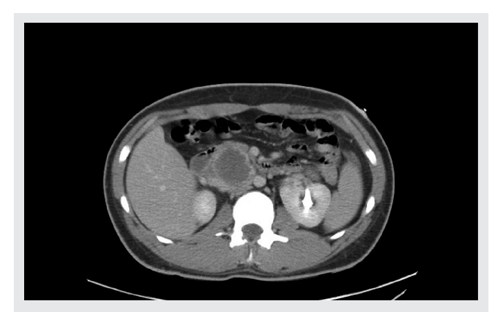
Figure 4. Abdominal CT with a mass of the head of the pancreas.

was reported in the pancreatic and lung biopsies. A right orchiectomy was performed, and final diagnosis for the patient was Stage IV non-seminoma mixed germ cell tumor with 90% embryonal carcinoma and 10% choriocarcinoma. He was started on chemotherapy.