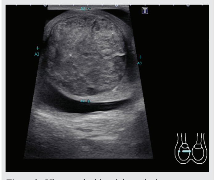
Figure 2. Ultrasound with a right testicular mass.