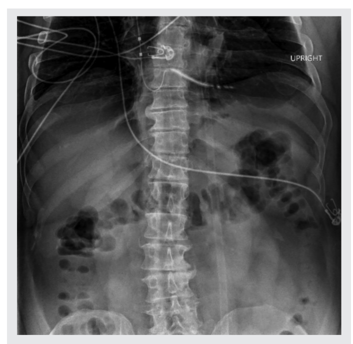
Figure 2. Abdominal x-ray with no signs of intestinal perforation or free intraperitoneal air.